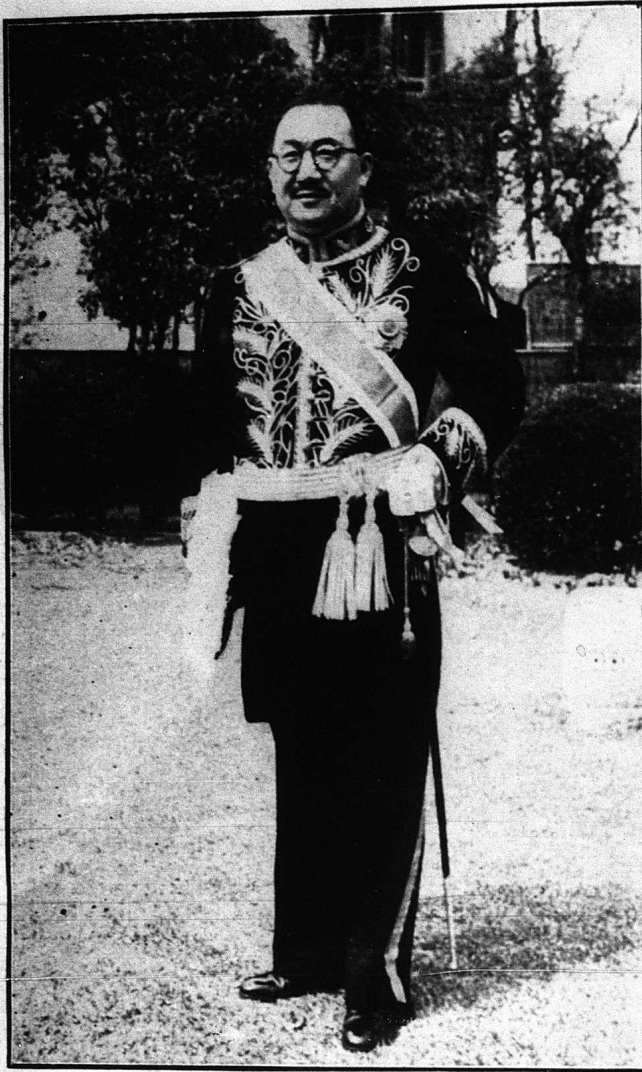
H. E. Dr. H. H. KUNG

(Minister of Finance and Chief Envoy to the Coronation of Their Majesties King George VI and Queen Elizabeth)